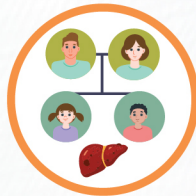
Family history of liver cancer & cirrhosis