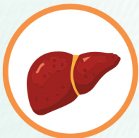
Individual with Hepatitis B/C infection