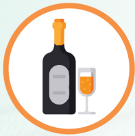
Heavy alcohol drinker