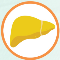
Individuals with fatty liver